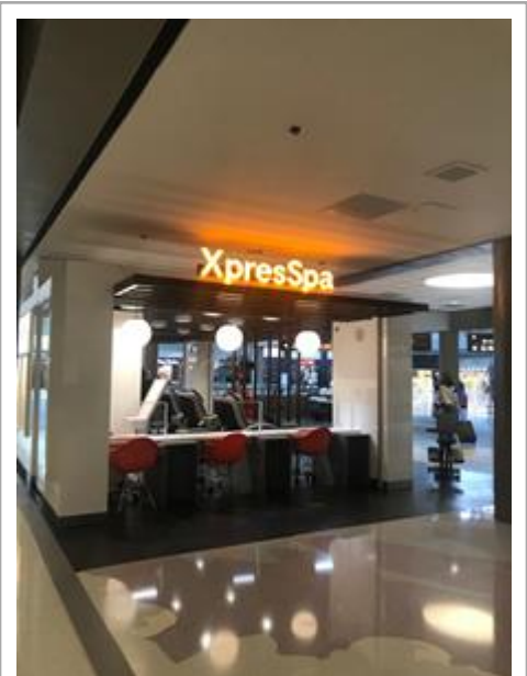
Airport terminal's Center Core